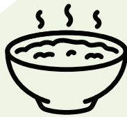
SOUPS & STEWS