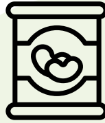
CANNED BEANS OR LEGUMES