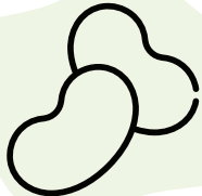
DRIED BEANS OR LEGUMES