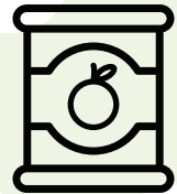
CANNED OR DRIED FRUITS