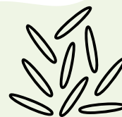
PASTA, RICE & GRAINS

YOUR DONATION IS HELPING TO FEED INDIVIDUALS AND FAMILIES FACING HUNGER!