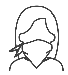
When outside, cover your face